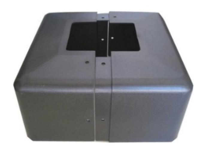
Figure 2 Standard base cover for lighting poles

Each pole should have a metal housing or base plate cover to keep safety from public injury if a child or adult falls on the metal bolts in the base if exposed. Above figures 1&2 show standard design of poles like existing at Rossmoor Parks.