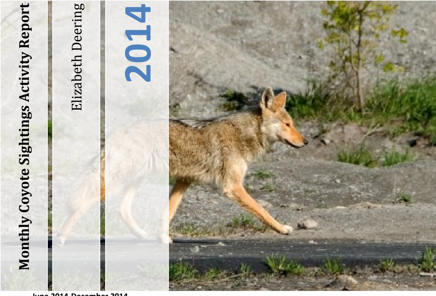
June 2014-December 2014

The Monthly Coyote Sightings Activity Report is intended to provide the Board with information regarding the number of coyote sightings and types of encounters with urban coyotes within the community.