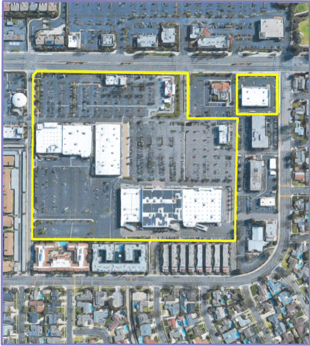
Figure B-3 Shops at Rossmoor