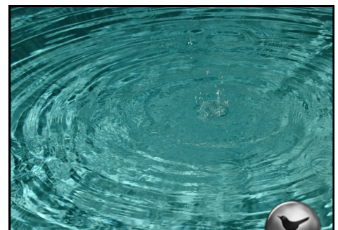
Drowning—the silent killer.