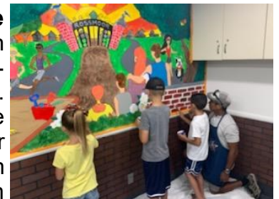
Children help paint the colorful mural in the new game room at Rush Park