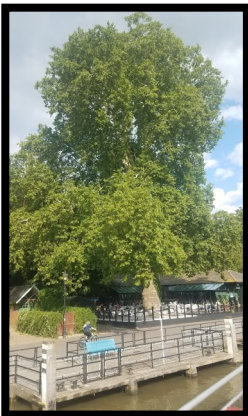
Richmond Riverside Plane Tree, London, UK