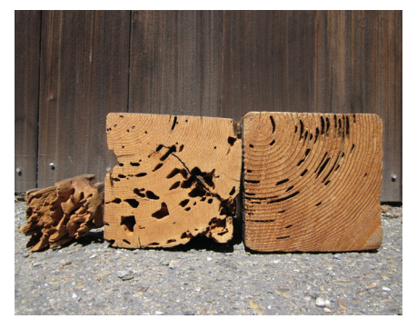
Figure 2. Damage to wood by dampwood (left), drywood (center), and subterranean (right) termites. (R.L. Tabuchi, U.C. Berkeley)

In the Sonoran Desert of southeastern California, Heterotermes aureus is the most destructive species of subterranean termites. This species has light-brown winged forms that fly in the early evening and are attracted to