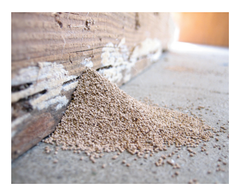
Figure 4. A pile of drywood termite fecal pellets on a horizontal surface. (R.L. Tabuchi, U.C. Berkeley)

lights. Another destructive species in this group, the Formosan subterranean termite, Coptotermes formosanus , is native to China but now established in California, thus far restricted to a small area near San Diego. Unlike the native Reticulitermes but similar to Heterotermes , Formosan subterranean termites swarm at dusk and are attracted to lights.