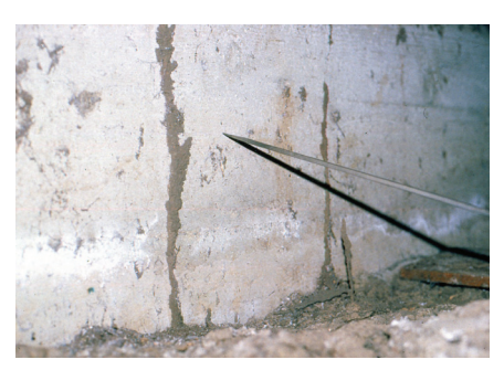
(5A) Working tubes

The excavations that termites make in wood are hollow, completely enclosed, more or less longitudinal cavities. Some species deposit light-brown excrement within cavities. Feeding in wood by subterranean termites generally follows the grain of wood; these species attack the softer springwood and leave the harder, less digestible summerwood. Many times this distinctive pattern of wood damage alone can be used to positively distinguish subterranean termite activity from that of other species.