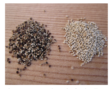
Figure 3. Drywood termite fecal pellets are oblong with six flattened sides. The color of pellets can vary with wood species fed on.