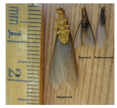
(1C) Reproductives (new kings and queens)

Figure 1. Various castes of dampwood, drywood, and subterranean termites. (R.L. Tabuchi, U.C. Berkeley)