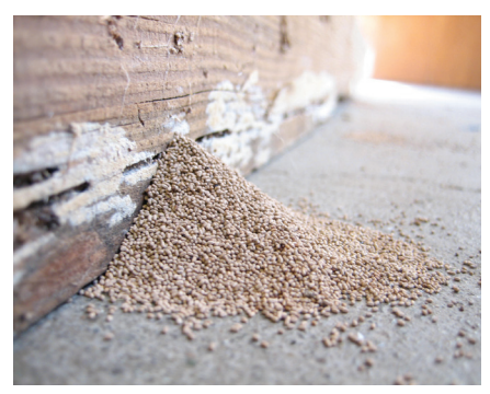
Figure 4. A pile of drywood termite fecal pellets on a horizontal surface. (R.L. Tabuchi, U.C. Berkeley)

lights. Another destructive species in this group, the Formosan subterranean termite, Coptotermes formosanus , is native to China but now established in California, thus far restricted to a small area near San Diego. Unlike the native Reticulitermes but similar to Heterotermes , Formosan subterranean termites swarm at dusk and are attracted to lights.