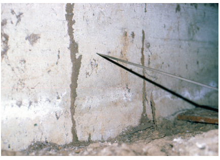
(5A) Working tubes

The excavations that termites make in wood are hollow, completely enclosed, more or less longitudinal cavities. Some species deposit light-brown excrement within cavities. Feeding in wood by subterranean termites generally follows the grain of wood; these species attack the softer springwood and leave the harder, less digestible summerwood. Many times this distinctive pattern of wood damage alone can be used to positively distinguish subterranean termite activity from that of other species.