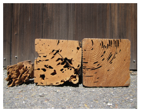
Figure 2. Damage to wood by dampwood (left), drywood (center), and subterranean (right) termites.

In the Sonoran Desert of southeastern California, Heterotermes aureus is the most destructive species of subterranean termites. This species has light-brown winged forms that fly in the early evening and are attracted to