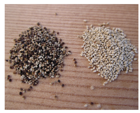
Figure 3. Drywood termite fecal pellets are oblong with six flattened sides. The color of pellets can vary with wood species fed on.