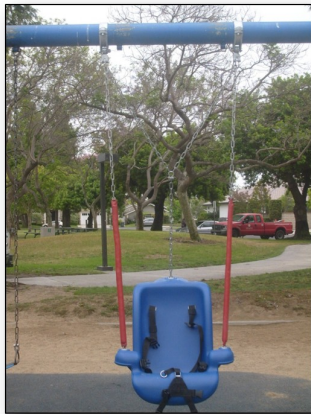
The new ADA compliant swing makes its debut at Rossmoor Park

To maximize your experience please bring: chairs, blankets, flashlights, insect repellent